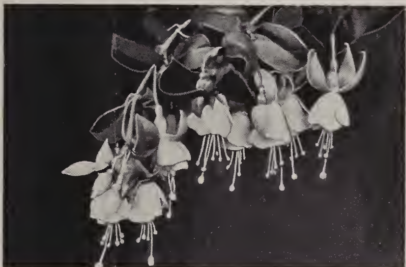
ABBEY FARGES. Tall growing silvery lilac and pink.

Lustre. Upright to arching growth with corolla of orange scarlet white pistil, calix and tube white, very effective. 25-35c.